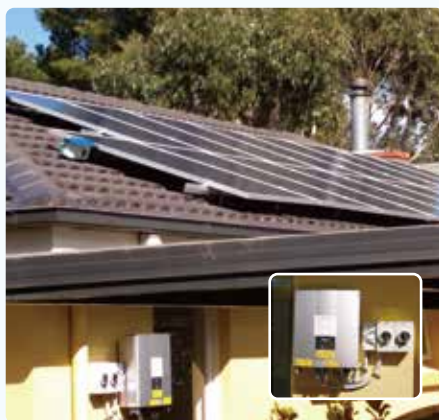
• Australia 5KW