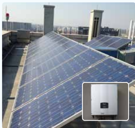
• Belgium 4KW