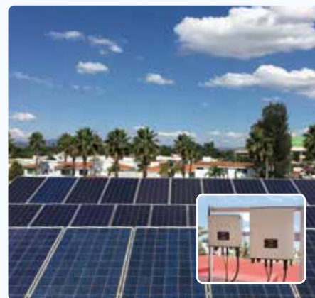
• Mexico 8KW